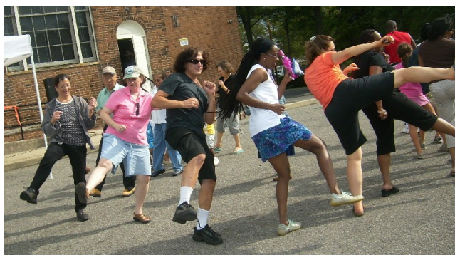
Ludlow residents kicking up their heels at the annual summer picnic!