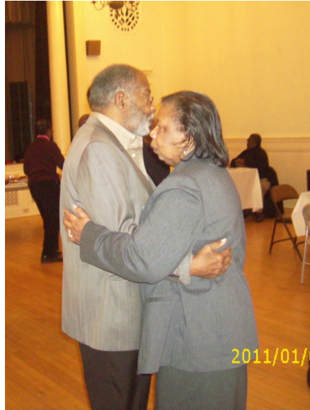
Good friends and good times!